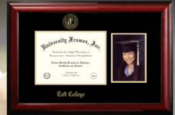
Classic Mahogany Diploma with 5 x 7 Portrait Frame