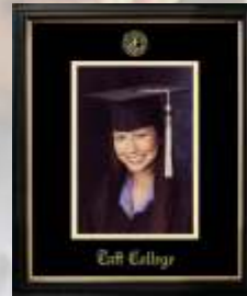
Petite Black 5 x 7 Portrait Frame