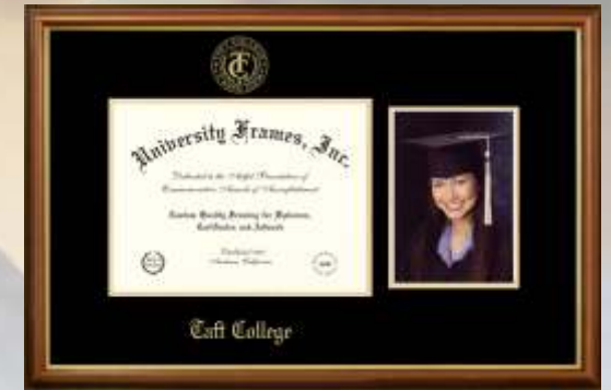
Petite Walnut Diploma with 5 x 7 Portrait Frame