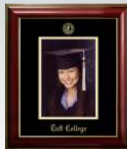
Petite Mahogany with Gold Trim 5 x 7 Portrait Frame