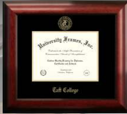
Satin Mahogany Diploma Frame