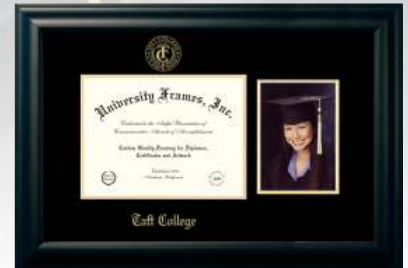
Satin Black Diploma with 5 x 7 Portrait Frame