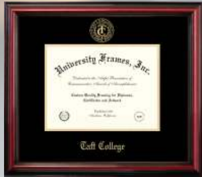
Petite Cherry Diploma Frame