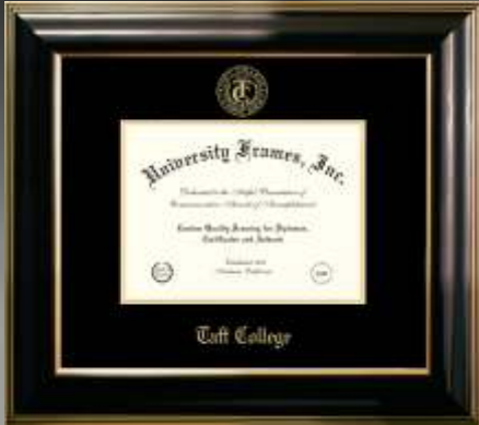
Classic Ebony with Gold Trim Diploma Frame

The frame allows your diploma to be removed and replaced at any time with ease. Mounting takes only minutes with the enclosed simple-to-follow instructions.