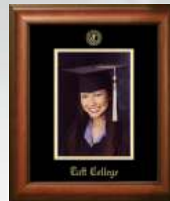
Satin Walnut 5 x 7 Portrait Frame